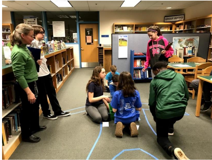
Hands-on learning in 7th grade science