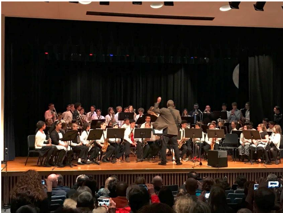
MRE, LBMS, and NRHS Jazz Bands onstage at the first annual Lancaster Jazz Night!